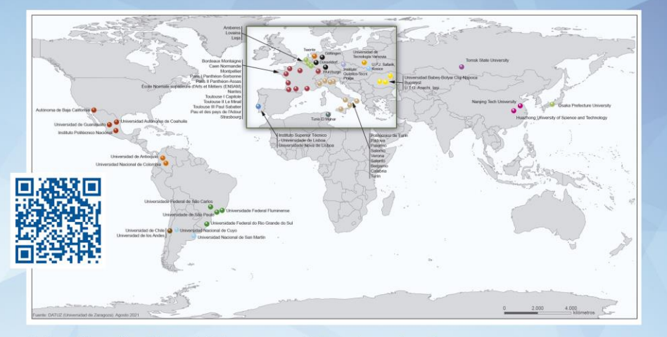
Universities with which cotutelle agreements have been signed